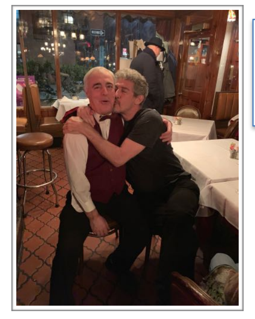
Our favorite bartender after a long night