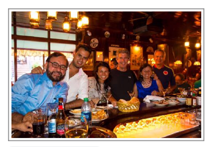
Our Colombian family