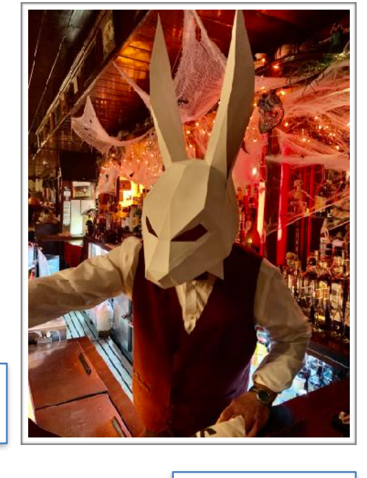
Our favorite bartender on Halloween